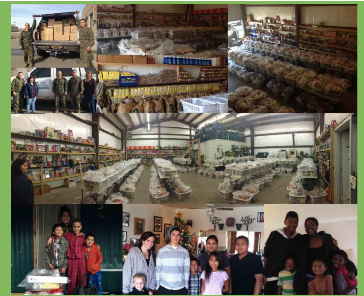
THANKS to all of our corporate and individual sponsors, whose donations made it possible to provide so richly for our community families in need this holiday season.